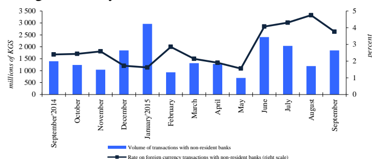
Dynamics of Operations and Interest Rates in the Interbank Credit Market on Transactions in Foreign Currency with Non-Resident Banks

The volume of credit transactions in foreign currency with non-resident banks amounted to KGS 1.9 billion having increased by 55.4 percent as compared to the same index of the previous month. The weighted average interest rate on credit transactions with non-